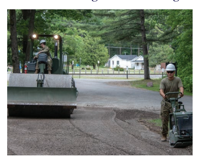
Innovative Readiness Training (IRT) Successfully Completes Another Phase of the Michigan Department of Natural Resources Gaylord District Parks and Recreation Division Ongoing Construction Project

1430 Engineering Company partnered with the Michigan Department of Natural Resources (MDNR) Parks and Recreation Division between 13 October and 30 November 2023, to support the MDNR's ongoing infrastructure improvement construction project at Young State National Park (the Park). Prior to this mission, Park employees were unable to conduct necessary Park maintenance due to winter weather restraints. The Army National